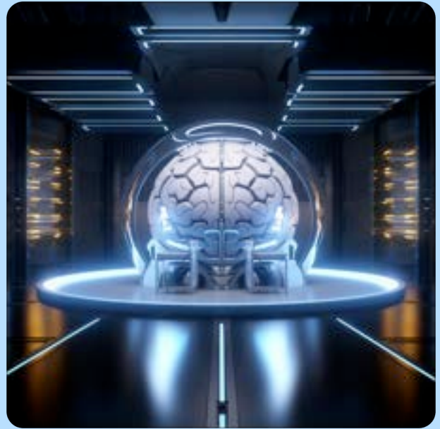
GPT is like a Brain in a Jar.

For that reason, we liken the trained model to a “brain in a jar” to reflect the fact that it has no memory and cannot learn from prompts or other information submitted to it. The LLM simply takes the information it is given and responds.